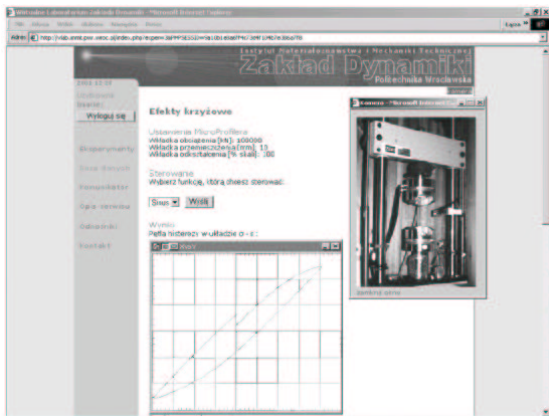
Fig. 3 Website view while experiments are on the run

The platform was tested on two different sets of experiments. In both cases tests were successful.